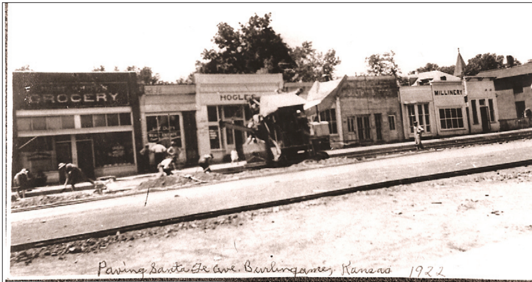
Paving Santa Fe Ave. Burlingame, Kansas 1922