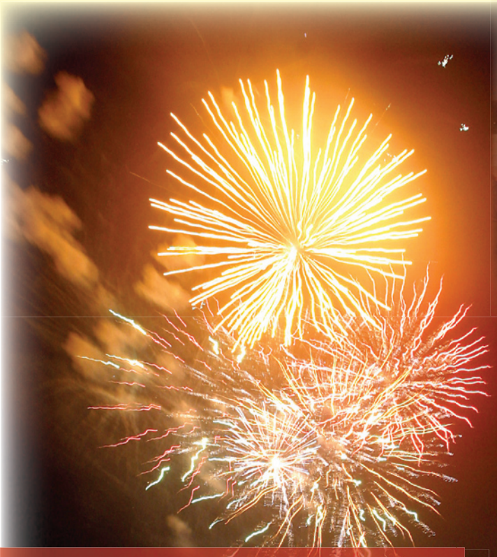
Saturday in the Park Celebration, 2007

Honoring the Past, Living the Present, Planning the Future