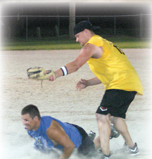
Scranton Annual Mens Ball Marathon